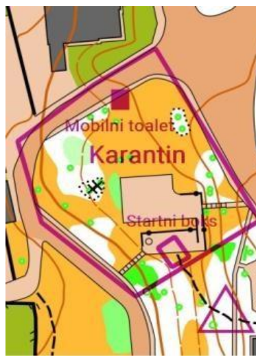
Map sample 1.day